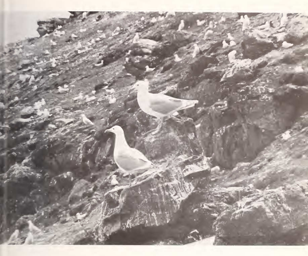
Fig. 17. Glaucous-winged gull colony; Shaiak Island, 14 June 1973.

predation (Petersen 1982) and many fledging in other years when no foxes were present. Predation by humans probably occurs regularly. On 14 June 1973, several boats of people from Quinhagak en route to Togiak stopped at Shaiak Island. They gathered (Fig. 18) at least 10 boxes and buckets of eggs, totaling several thousand. An estimated 5,000 glaucouswinged gulls were present on Shaiak Island in 1976, and comparable numbers were present other years. Gulls nested sparsely along the cliffs at Cape Peirce; one nest had a downy young on 10 August 1970.